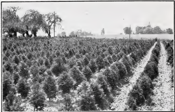
Retinospora Plumosa , 1 to 1½ ft.